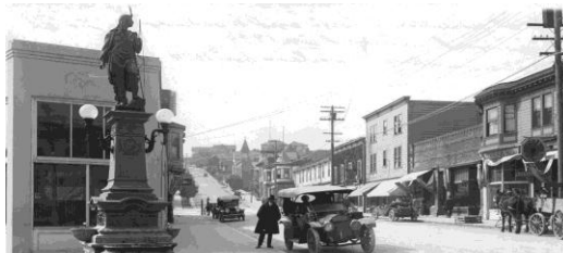
Donated in 1909, this Indian statue mysteriously disappeared in the 1930s. Replaced 1984.