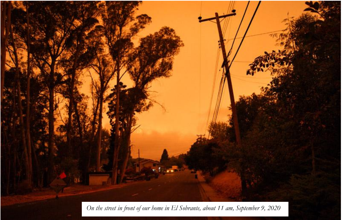
On the street in front of our home in El Sobrante, about 11 am, September 9, 2020

In our last issue of the Bulletin , we suggested that, as we are living through an historic period in our nation's history, our readers forward to us anything of interest (documents, images, etc.) that pertain to two of the most pressing issues, the Covid-19 Pandemic and the Black Lives Matter movement. At the time of our Summer newsletter's publication, we had yet to experience the changes to our daily lives caused by the multiple fires that were to erupt in the western U.S., particularly in California, Oregon, and Washington. At the time of this writing, the fires are still burning, but, hopefully, the worst has passed. The photo above was taken on September 9, which, for most of us living here in the Bay Area, was by far the worst day we had experienced. The heavy smoke, combined with the clouds and fog, created a peculiar and ominous atmosphere, and a twilight that lasted all day long. I have lived in the Bay Area for over three-quarters of a century, and I don't remember a day like this. Your experience was probably much the same. September 9, 2020, has become part of our shared experience, at least for us living in the West.